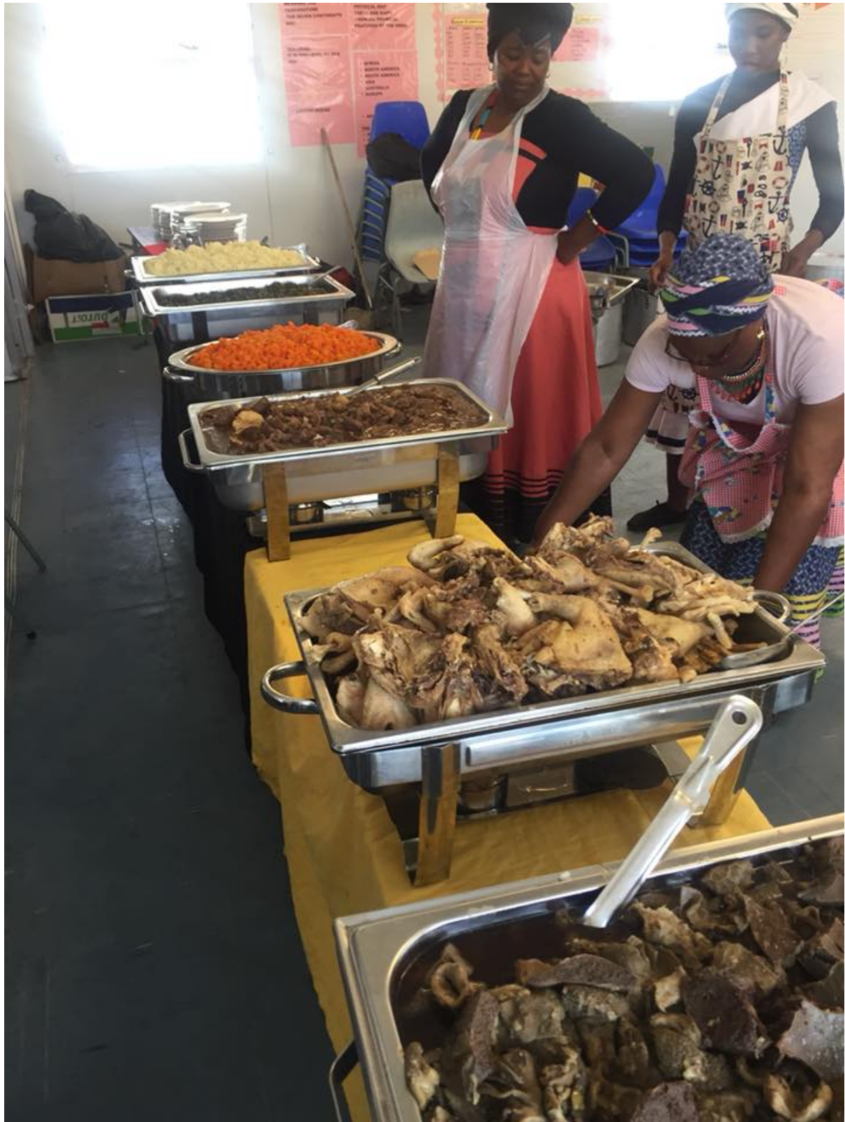
From far picture : Samp, spinach, carrot, beef, 'umlegwa' freshly slaughtered chicken, offal