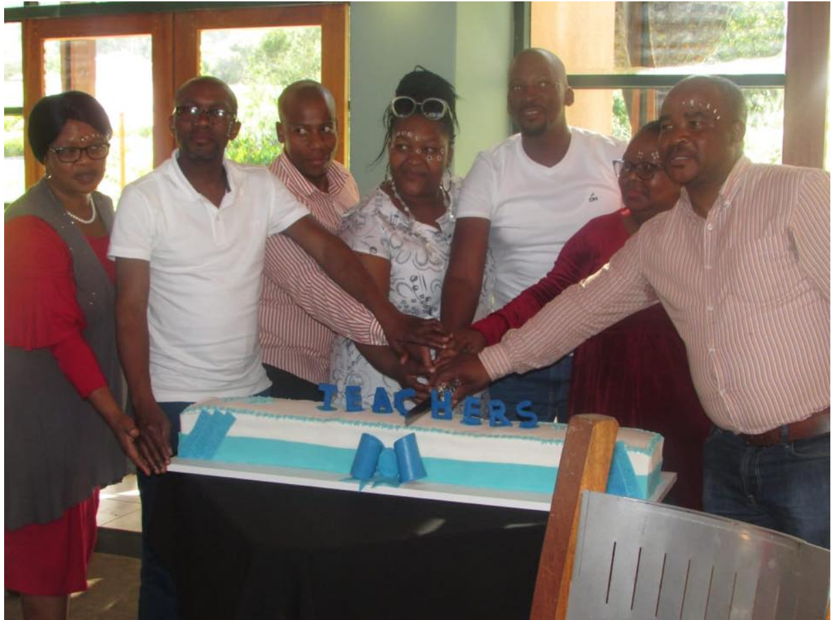
The School Management Team cutting the cake

Every 5 th October is World so this year was no different for us as well . The teachers went out for lunch