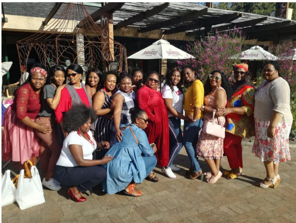
Female teachers looking beautiful