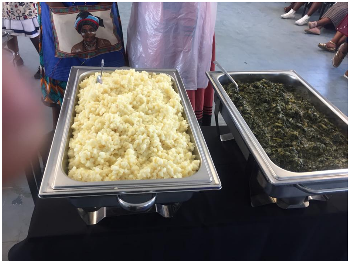
African meal called Samp on the left and spinach

Every September in South Africa in particular the 24 th September of each that is celebrated as the national heritage day. What this means is that we remember our roots and where we come from by wearing our clothes and eat food that our fore fathers eat. Please see it in colours