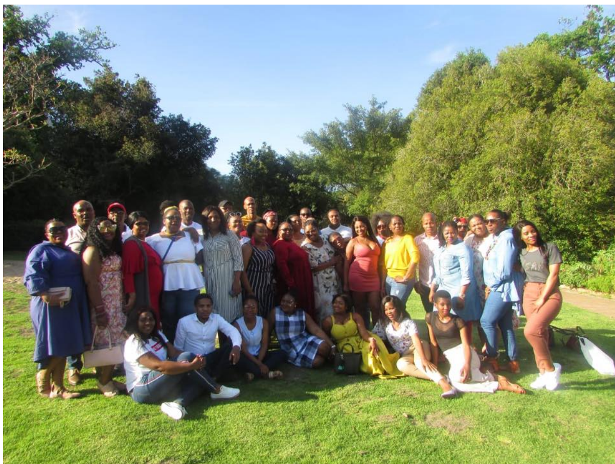
The entire staff